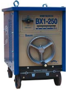
(2) ماكينة لحام 250 أمبير + عده موديل : NGBX250 Machine BX1-250-2 Welding