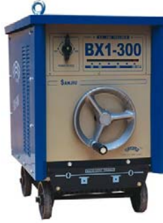
(3) ماكينة لحام 300 أمبير + عده موديل : NGBX300 Machine BX1-300-2 Welding