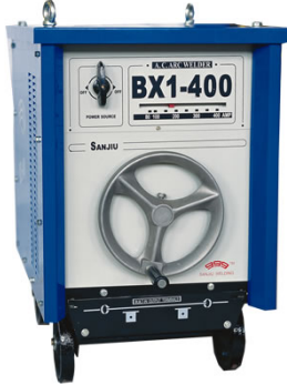
(4) ماكينة لحام 400 أمبير + عده موديل : NGBX400 Machine BX1-400-2 Welding