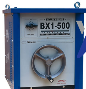
(5) ماكينة لحام 500 أمبير + عده موديل : NGBX500 Machine BX1-500-2 Welding