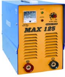
(6) موديل: NGBZ125 ماكينة لحام متناوب التيار (INVERTER) A 125 -10 Machine ZX7-125 Welding