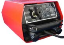
(1) ماكينة لحام 160 أمبير يدويه + عده موديل : NGBX160 Machine BX6-160-2 Welding