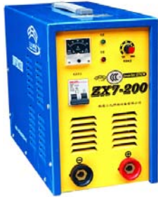
(7) موديل : NGBZ200 ماكينة لحام متناوب التيار (INVERTER) A 200 - 10 Machine ZX7-200 Welding