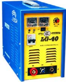
(8) موديل : NGBLG ماكينة قص بلازما على الهواء 12 mm Machine LG 40 Welding